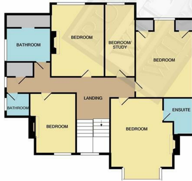
1ST FLOOR APPROX. FLOOR AREA 1139 SQ.FT. (105.8 SQ.M.)