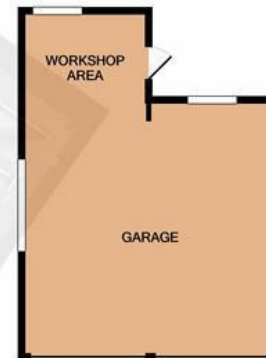
DETACHED GARAGE WITH MEZZANINE APPROX. FLOOR AREA 317 SQ.FT. (29.4 SQ.M.)

TOTAL APPROX. FLOOR AREA 2646 SQ.FT. (245.8 SQ.M.)