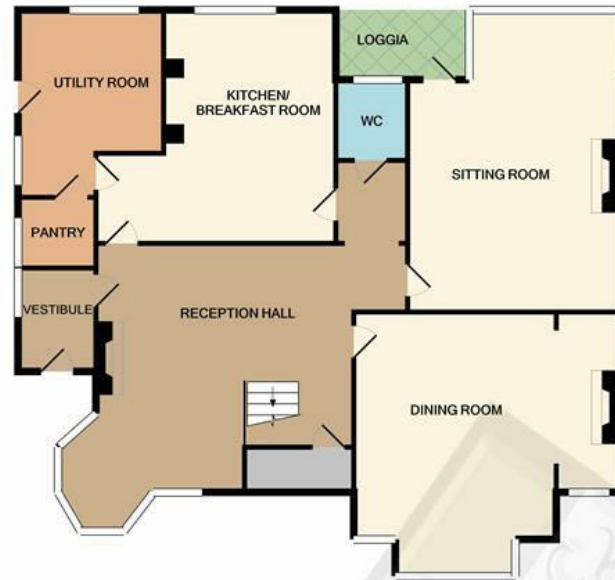
GROUND FLOOR APPROX. FLOOR AREA 1190 SQ.FT. (110.6 SQ.M.)